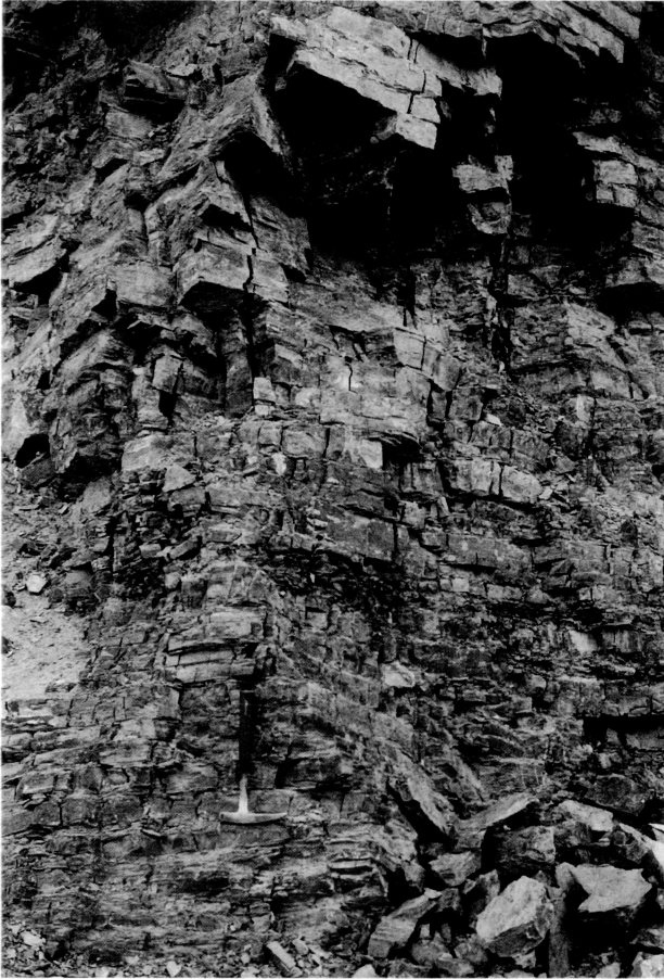
Fig. 3. Photograph of stratified siliceous mudstone where the sample (98061027) was collected. The hammer is 33 cm in length.

This faunal assemblage is characterized by having relatively abundant spumellarians and by being poor in nassellarian taxa. The most abundant taxa are species belonging to the genera Pseudostylosphaera Kozur and Mostler and Muelleritortis Kozur. It is noted that the genus Triassocampe Dumitrica, Kozur and Mostler, which commonly occurs in corresponding radiolarian-bearing strata in other areas, is rarely observed in this assemblage.